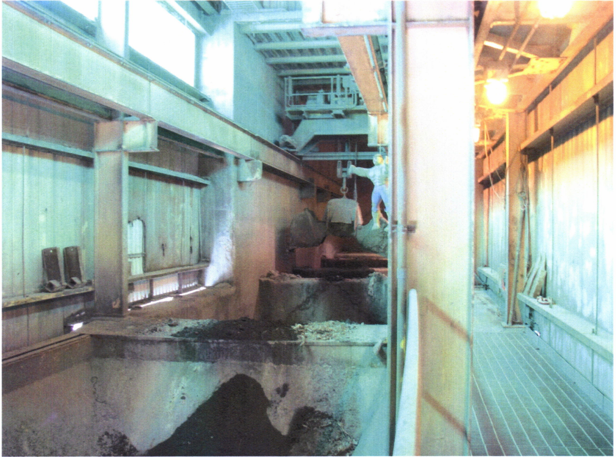
The ash mixing and load out area