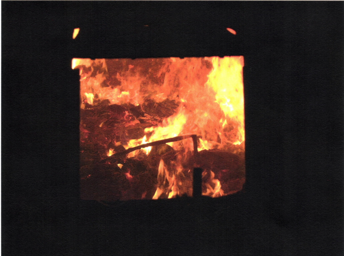
Looking directly into the furnace of the energy recovery facility