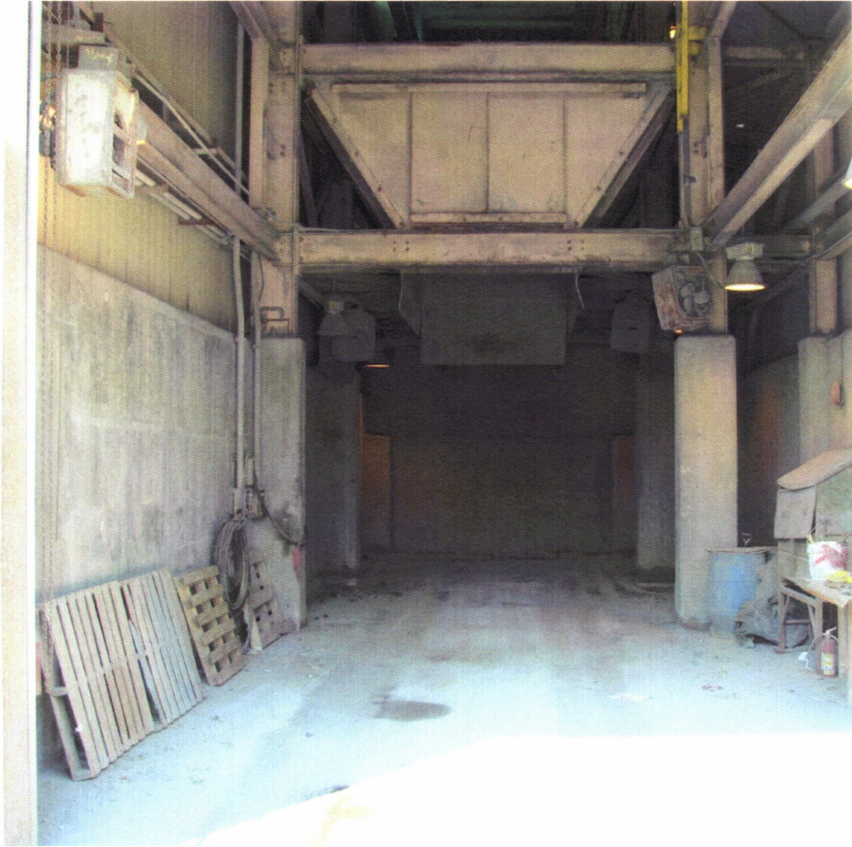
Ash truck load out area. The ash is removed from the plant and moved to the landfill for final cover.