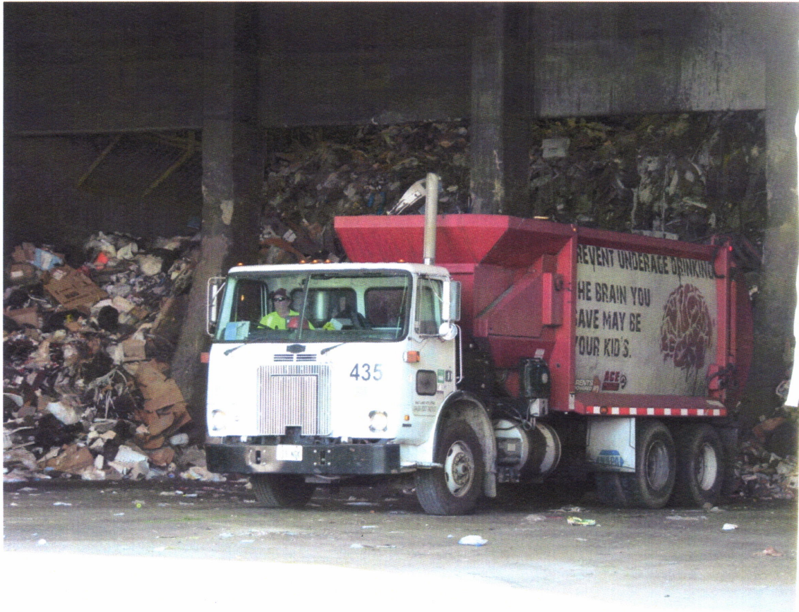
A photo of the waste material being dumped on the tipping floor, prior to the waste being consumed in the furnace.